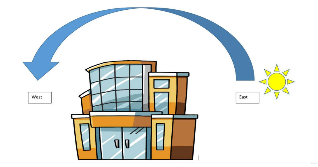
Figure 3: commercial/office orientated on an east - west axis

4.11 These are best orientated in an east –west orientation with most glazing on the north side to avoid excessive heat gain, which can be an issue even in the winter months.